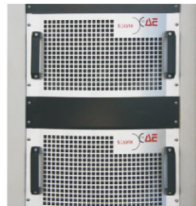
Sputtering Power Supply 溅射电源