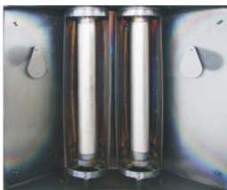
Rotary Cathode Sputtering 柱靶阴极