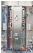
Planar Cathode Sputtering 平面阴极