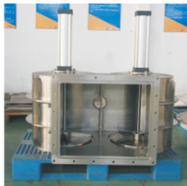
High Vacuum Valve 高阀